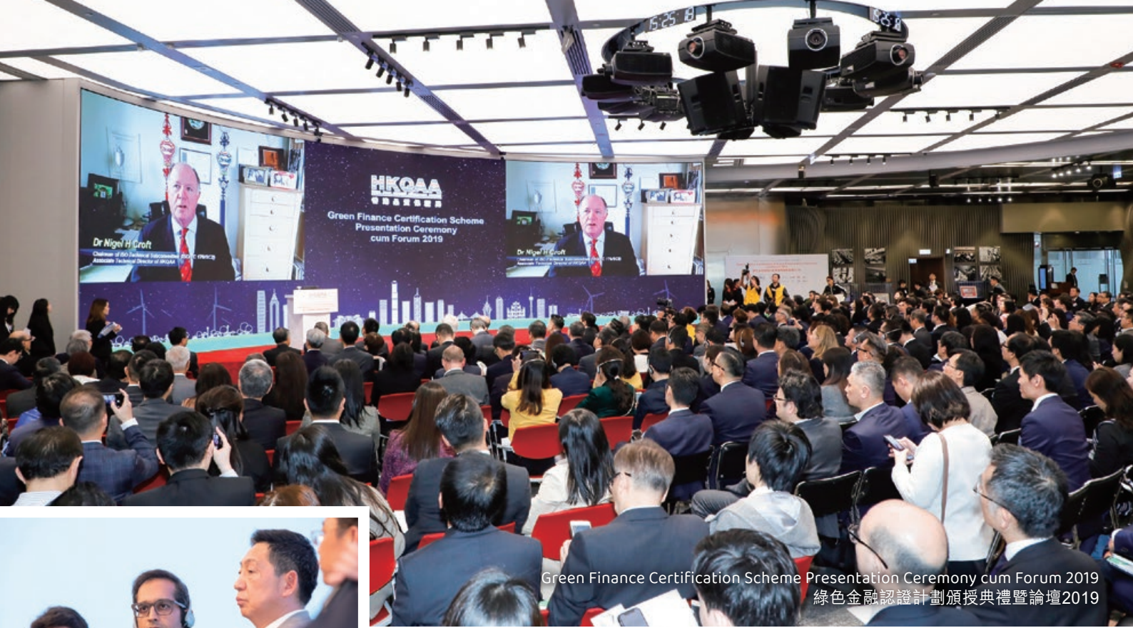
Green Finance Certification Scheme Presentation Ceremony cum Forum 2019 綠色金融認證計劃頒獎典禮暨論壇2019