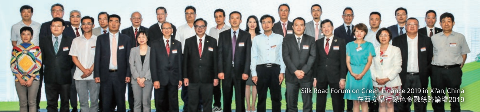
Silk Road Forum on Green Finance 2019 in Xi'an, China 在西安舉行綠色金融絲路論壇2019