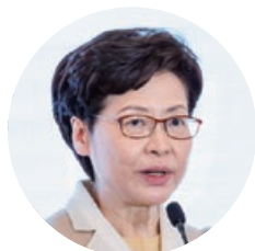
Mrs Carrie Lam Cheng Yuet-ngor , GBM, GBS, JP Former Chief Executive of the Hong Kong Special Administrative Region 林鄭月娥女士 , GBM, GBS, JP 香港特別行政區前任行政長官