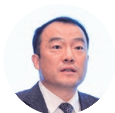
Mr Wang Yong Former Vice Mayor of the Xi'an Municipal People's Government 王勇先生 前西安市人民政府副市長