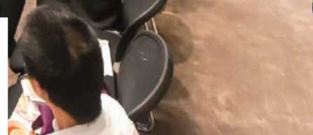
Green Finance Certification Scheme Launching Ceremony cum Seminar in 2018 2018年舉行「綠色金融認證計劃」開展儀式暨研討會