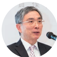
Mr James Henry Lau JR GBS, JP Former Secretary for Financial Services and the Treasury 劉怡翔先生, GBS, JP 前財經事務及庫務局局長