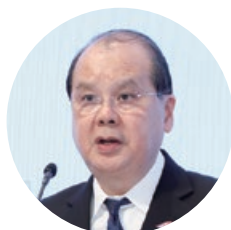
Mr Matthew Cheung , GBM, GBS, JP The then Acting Chief Executive of the Hong Kong Special Administrative Region 張建宗先生 , GBM, GBS, JP 時任香港特別行政區署理行政長官