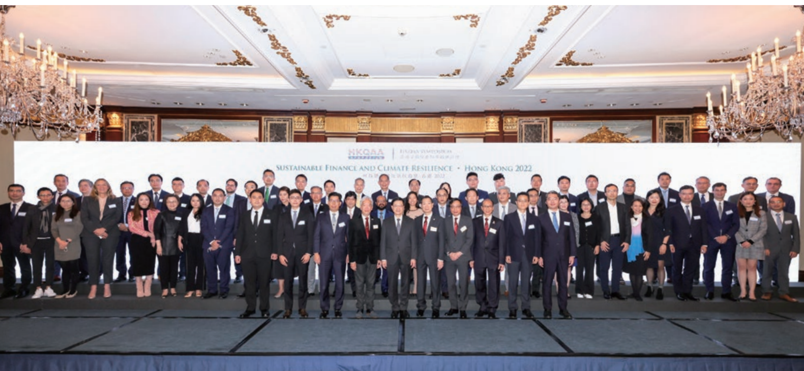
Group photo with green and sustainable finance issuers, banks and financial institutions

主要嘉賓與香港品質保證局董事局成員、綠色和可持續金融認證計劃技術委員會成員、演講嘉賓、亞洲地區駐港總領事和經貿領事，以及來自政府監管機構和業界知名組織的領袖合照