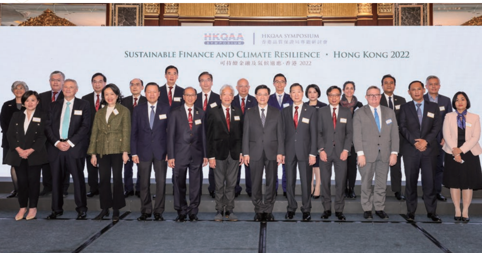
Group photo with the HKQAA Governing Council members, Green and Sustainable Finance Certification Scheme Technical Committee member, guest speakers, consul generals and consuls of trade from Asian countries in Hong Kong, as well as leaders of regulatory organisations and renowned associations

主要嘉賓與香港品質保證局董事局成員、綠色和可持續金融認證計劃技術委員會成員、演講嘉賓、亞洲地區駐港總領事和經貿領事，以及來自政府監管機構和業界知名組織的領袖合照