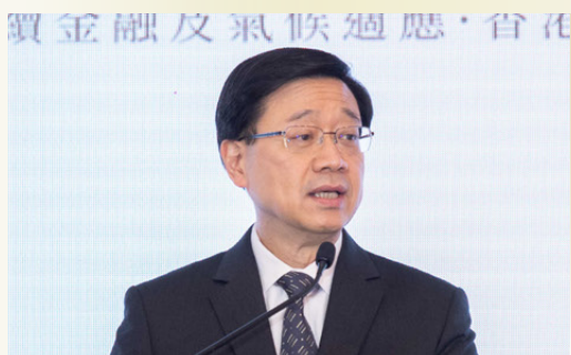
The Hon John KC Lee, GBM, SBS, PDSM, PMSM 李家超先生, 大紫荊勳賢, SBS, PDSM, PMSM

The Chief Executive of the Hong Kong Special Administrative Region 香港特別行政區行政長官