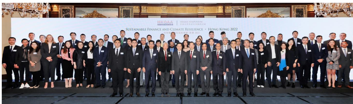
Group photo with green and sustainable finance issuers, banks and financial institutions.