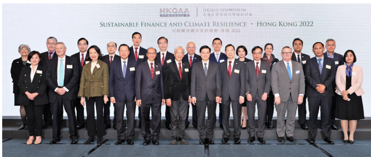
Group photo with the HKQAA Governing Council members, Green and Sustainable Finance Certification Scheme Technical Committee member, guest speakers, consul generals and consuls of trade from Asian countries in Hong Kong, as well as leaders of regulatory organisations and renowned associations