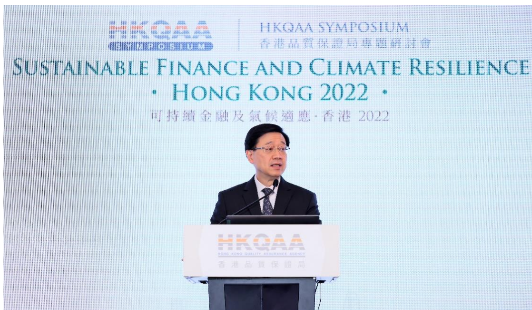
The Hon John KC Lee, GBM, SBS, PDSM, PMSM, The Chief Executive of the HKSAR, is the officiating guest.