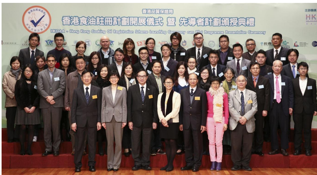
Officiating guests, governing council members of HKQAA, as well as the registered organisations and Scheme Companions.