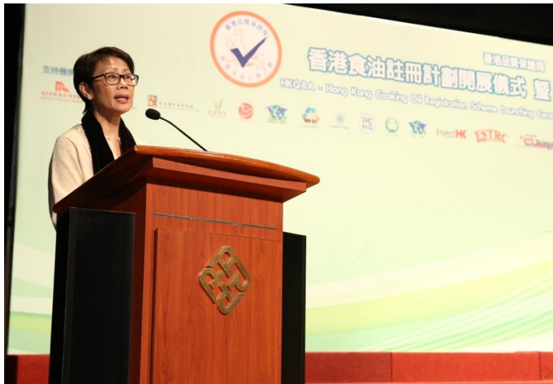
Officiating guest, Ms Christine Loh, Under Secretary for the Environment, addresses the ceremony.