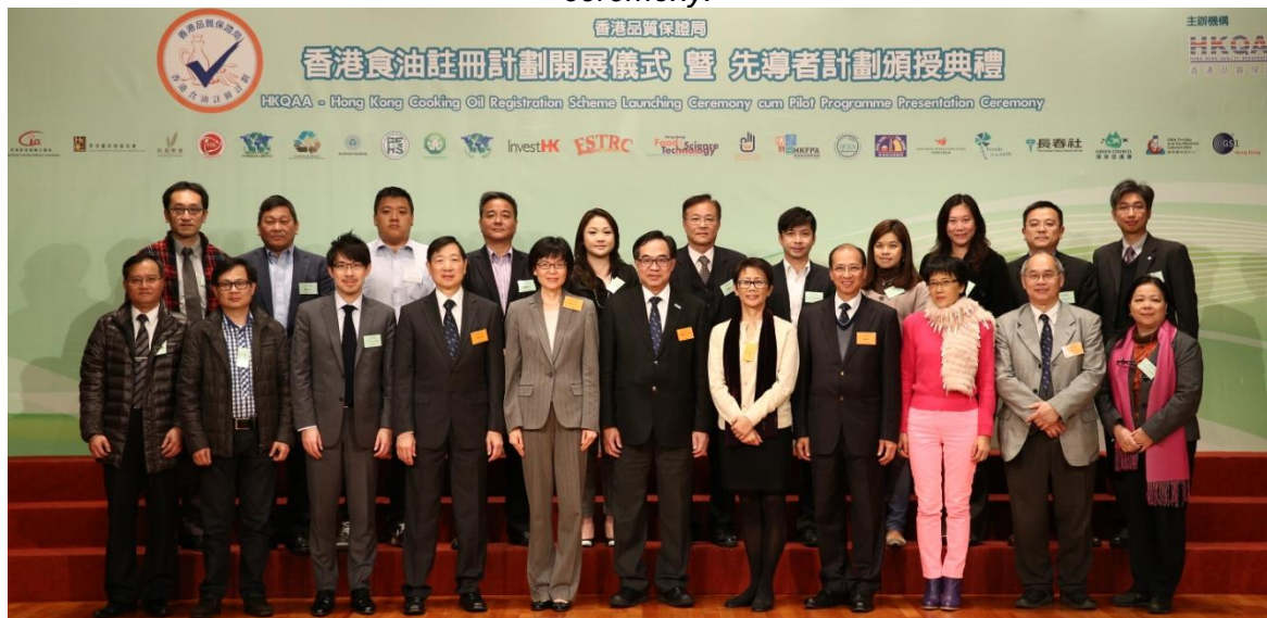
Officiating guests, governing council members of HKQAA and supporting organisations of the Scheme.